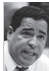
Kelvin Sampson 1994